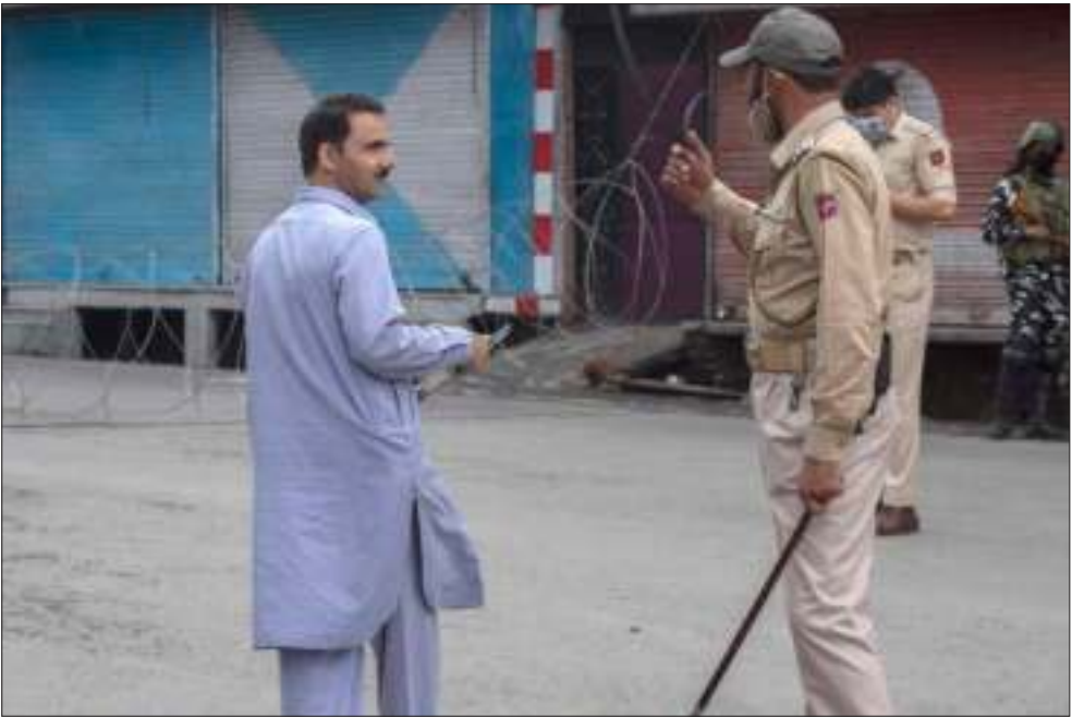
AUTHORITIES ON TUESDAY IMPOSED RESTRICTIONS in Downtown Srinagar as Kashmir marked the Martyrs Day.