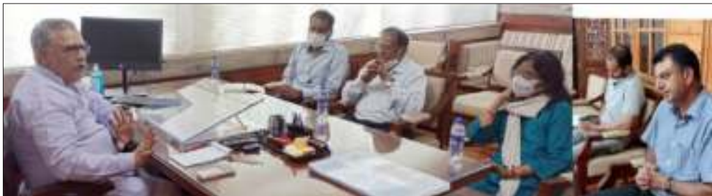
KO NEWS DESK