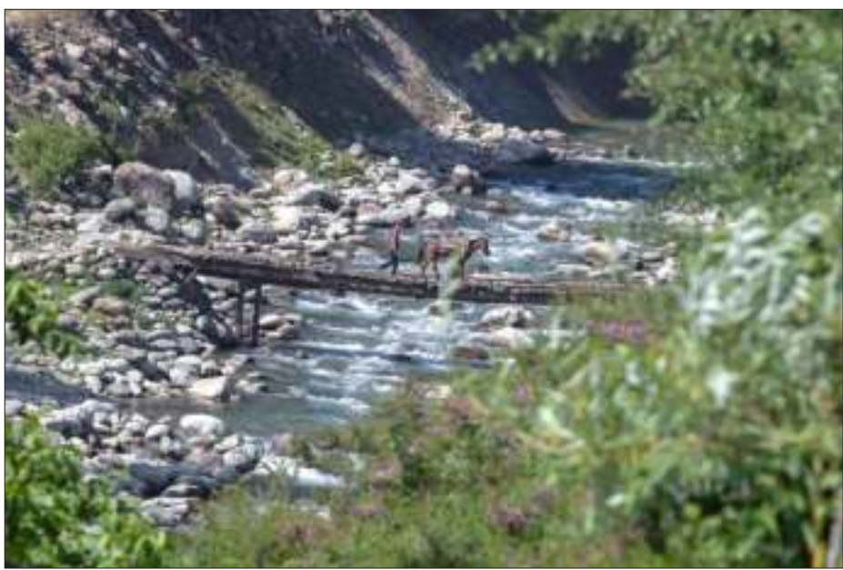
A MAN HOLDS HIS HORSE WHILE CROSSING a wooden bridge over Doodh Ganga river in Doodpathri on Monday.

In times of COVID when economic hardship faced by people is on the rise, the rulers of the land are least thoughtful of the consequences such harsh actions will have on those dismissed and their families, the statement said.