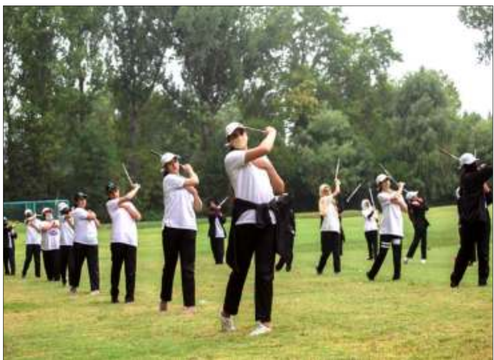
WOMEN GOLFERS getting training in Kashmir's first Golf Training Academy.