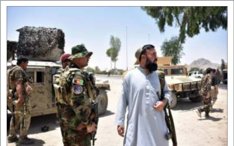
Afghan security personnel stand guard along the road amid ongoing fights between Afghan security forces and Taliban fighters in Kandahar on July 9, 2021.