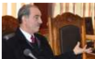
Observer News Service

SRINAGAR: The High Court on Wednesday asked authorities to ensure vaccination of the disabled persons in Jammu and Kashmir.