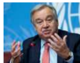
Report on Children 2021, Al-Jazeera reported Wednesday.

"I call upon the government to take preventive measures to protect children, including by ending the use of pellets against children, ensuring that children are not associated in any way to security forces, and endorsing the Safe Schools Declaration and the Vancouver Principles," he said in the UN