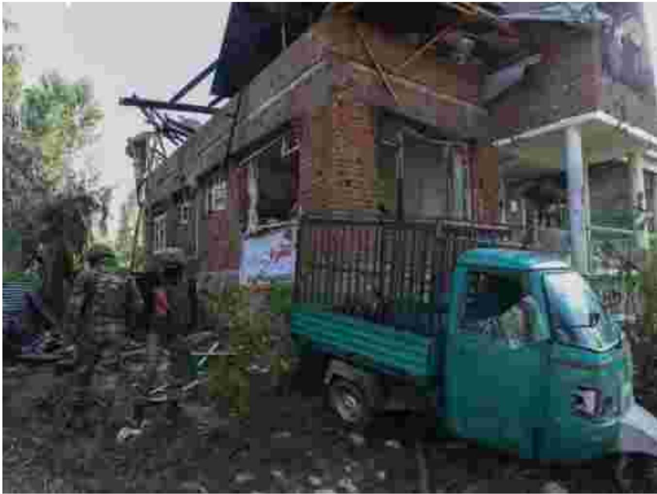
Soldiers stand outside the house damaged during overnight encounter with militants in Maloora area of Srinagar on Tuesday.