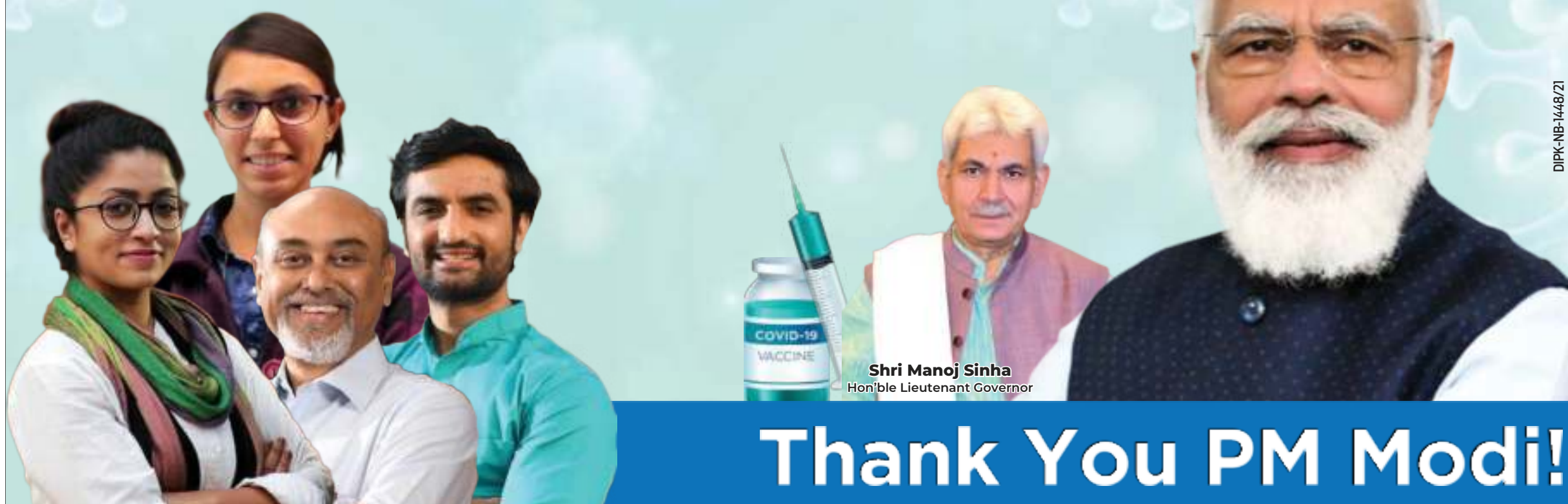
Shri Manoj Sinha Hon'ble Lieutenant Governor