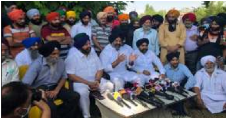
Observer News Service

SRINAGAR: —Shiromani Akali Dal (SAD) leader Manjinder Singh Sirsa on Monday said that some vested interests were trying to hijack the “forced conversion issue” and were giving it a political colour. Sirsa, who landed in Srinagar on Sunday after the Sikh community held a protest demonstration against the alleged “forced conversation” of two Sikh girls from Srinagar. He alleged that two more young women of their community have been “kidnapped” while only one was handed over to family the other one was still untraceable. Sirsa, who is also the president of Delhi Gurudwara Prabhandak Committee, joined the protesters in Srinagar. The incident has been given a political colour, with Sikhs demanding the introduction of anti-conversion law in Jammu and Kashmir, as has been implemented in Uttar Pradesh and Madhya Pradesh. However while addressing a press conference, Sirsa told reporters that he has apprised his community that some wested interests were trying to hijack the incident and bring out their own agenda. “The communal harmony among the Kashmiri Sikhs and Muslims should not be damaged. Some people will try to make it a different issue. But we had a meeting today and I have informed