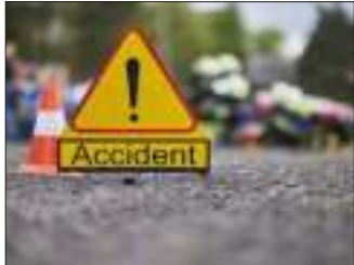
Observer News Service

BHALESSA: A Special Police Officer (SPO) was killed while forest guard was injured in a road