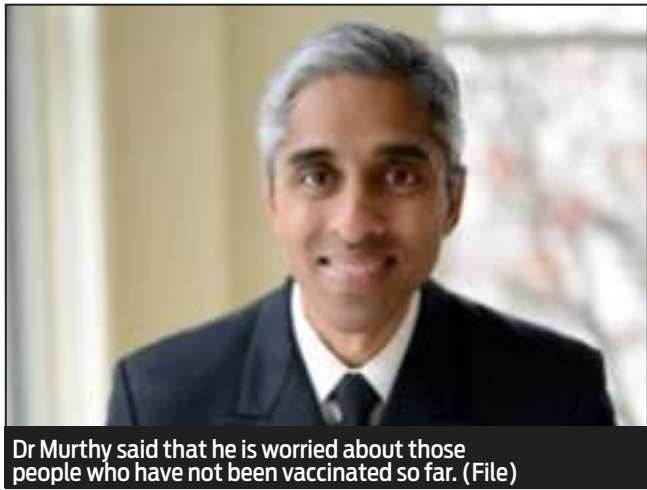
Dr Murthy said that he is worried about those people who have not been vaccinated so far. (File)

kid's level of risk really depends on where you live and how high the community vaccination rates are. And this is why we always say - and I say this as a dad who's got two young kids, three and four, whose ... we don't have a vaccine available for kids that young. So, I'm worried about my