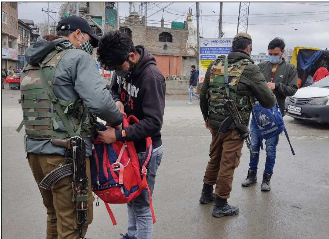
Amid a surge in militant attacks, cops frisking two youth in Srinagar's Hari Singh High Street on Monday.