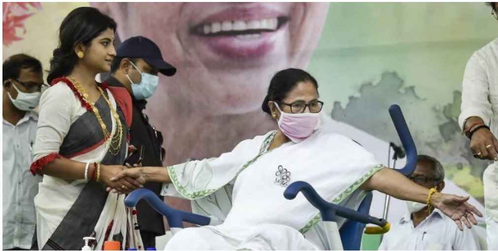
West Bengal Chief Minister Mamata Banerjee along with TMC candidate from Rajerhat Aditi Munshi during election campaign, in Nandigram.