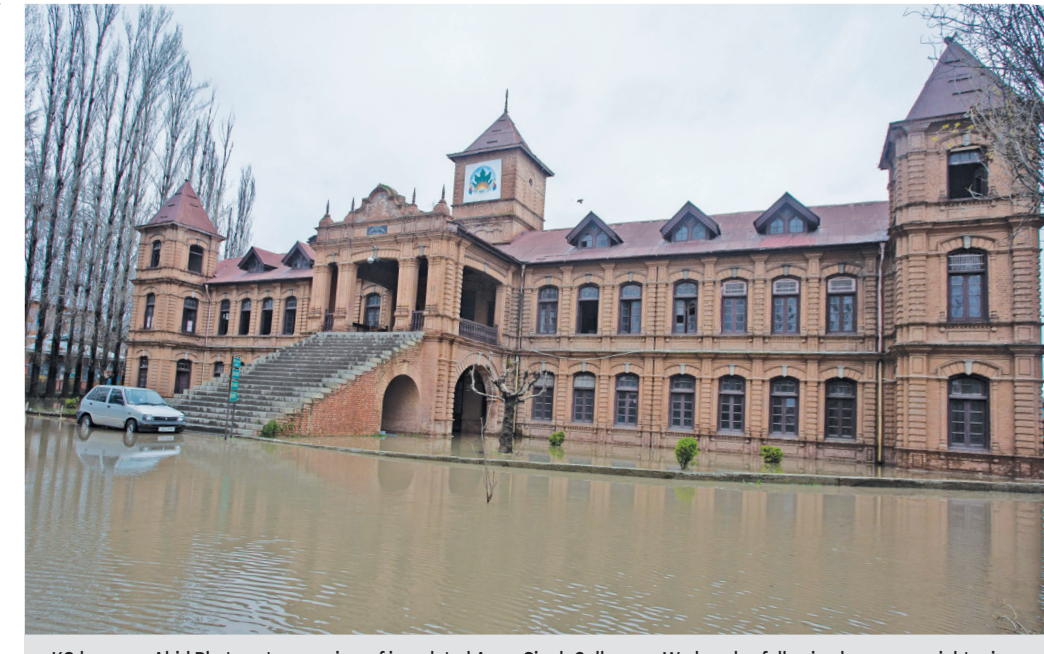
KO lensman Abid Bhat captures a view of inundated Amar Singh College on Wednesday following heavy overnight rains.