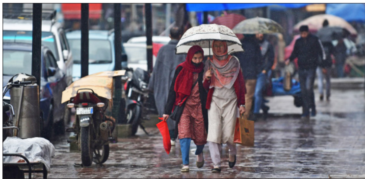
KO Photo: Abid Bhat