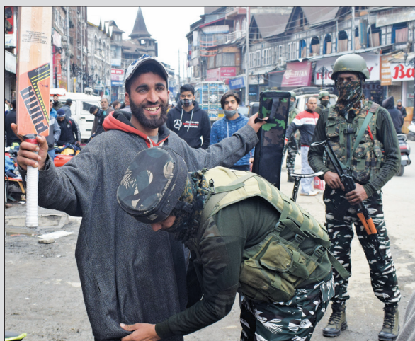
A pheran-clad youth holding a cricket bat smiles, as a CRPF man frisks him in Srinagar's Lal Chowk on Saturday.