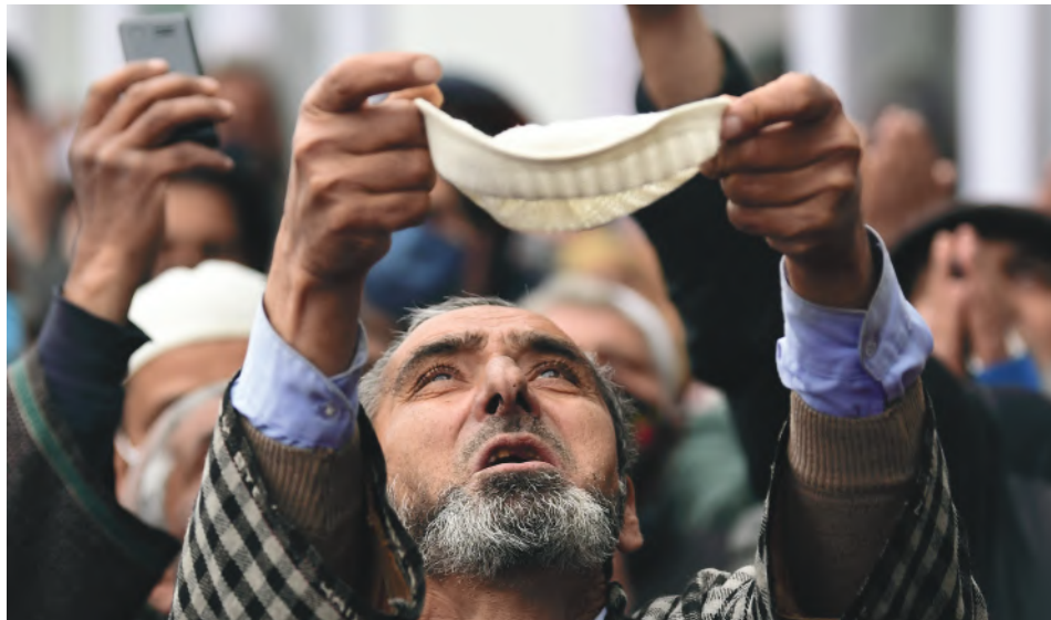
A man raises his hands in supplication as the unseen cleric of Hazratbal Shrine displays a relic believed to be from beard of Prophet Muhammad (PBUH) on the occasion of Me'raj-e-Aalam on Friday.