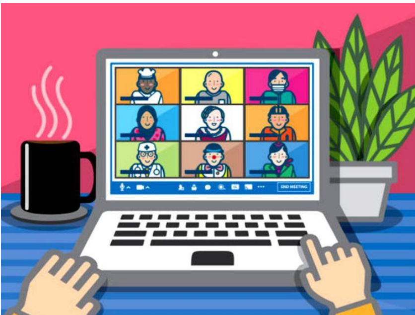
Stultifying on video

Videoconferencing also allows for meetings with far-flung participants elsewhere in the country — or in other countries — that would have been too expensive and environmentally wasteful to convene in the live era. Now it's customary to have a visitor call in from across the country or an ocean and to conduct seminars with colleagues from around the world. Less human warmth, but more human connection.