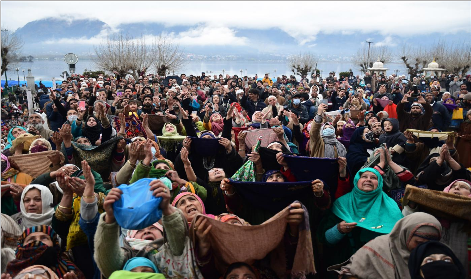
DRIZZLING DEVOTION: On the eve of Me'raj-e-Alam, faithful thronged the Hazratbal shrine amid rains on Friday.