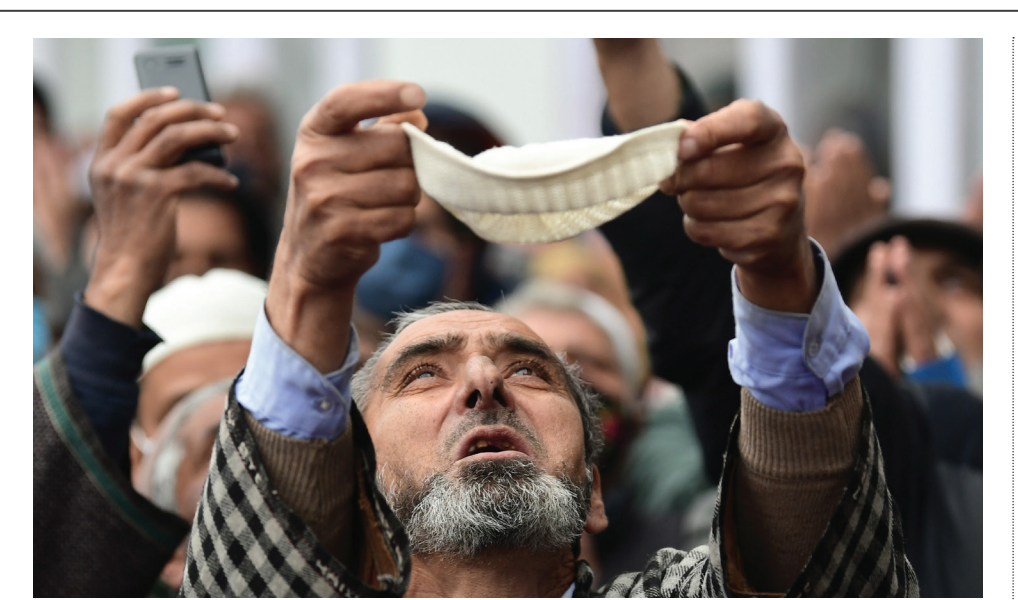
A man raises his hands in supplication as the unseen cleric of Hazratbal Shrine displays a relic believed to be from beard of Prophet Muhammad (PBUH) on the occasion of Me'raj-e-Aalam on Friday.