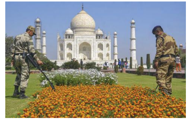
Security personnel with a sniffer dog check for bombs in the premises of the historic Taj Mahal, in Agra, on Thursday.