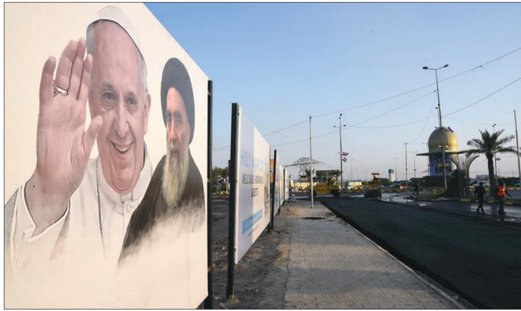
A poster of Pope Francis and Iraq's top Shiite cleric, Ayatollah Ali Al-Sistani, is seen along a street ahead of the Pope's planned visit to Iraq, in Najaf, Iraq, March 3, 2021.

And in 2018, at least 30 migrants died when a boat capsized off Yemen, with survivors reporting gunfire.