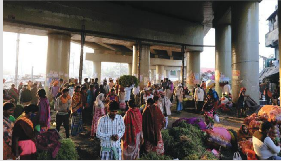
India's status change means that less than 20% of the world's people now live in a "free" country.