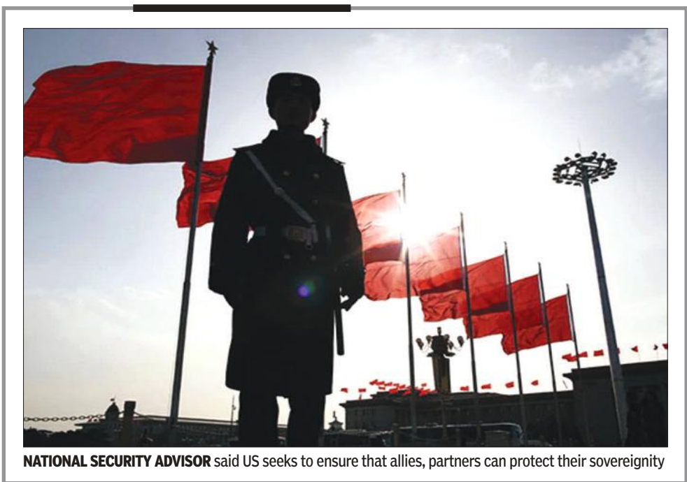
NATIONAL SECURITY ADVISOR said US seeks to ensure that allies, partners can protect their sovereignty