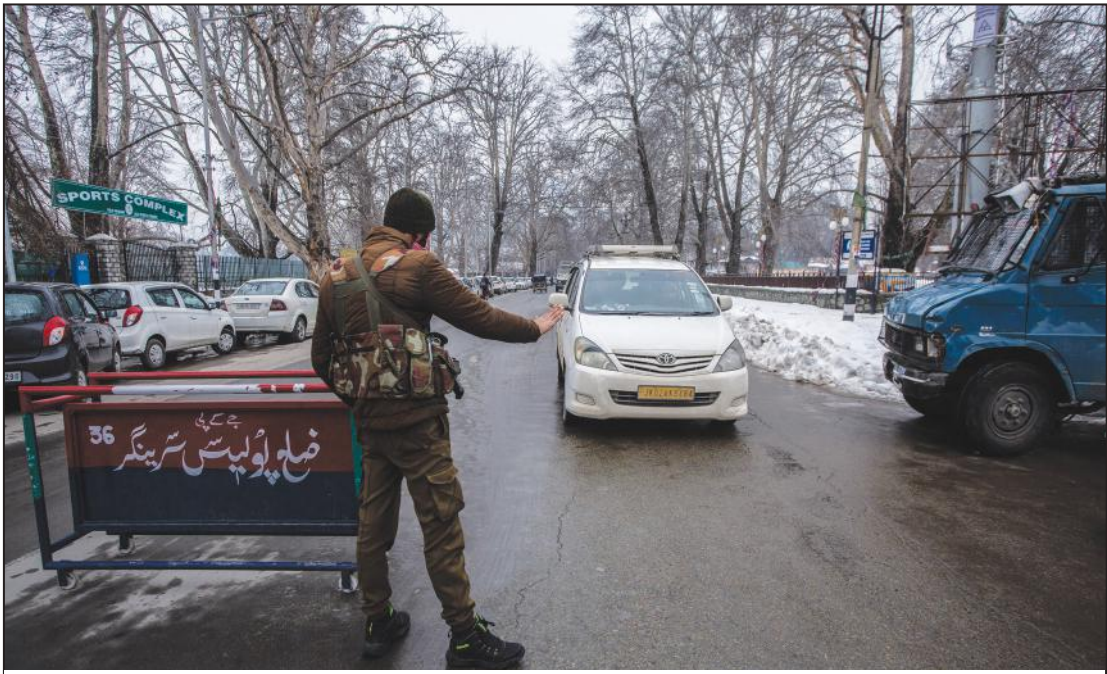
In view of security arrangements ahead of Republic Day, a cop stopping a vehicle for checking on a Srinagar Road on Monday.