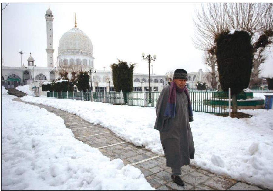
AN ELDERLY MAN walks through the compound of snow-covered Hazratbal shrine on Monday.