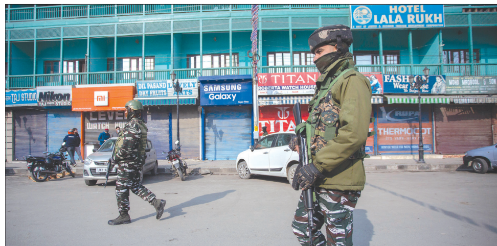
A SHUTDOWN WAS observed in parts of Srinagar on Friday against the killing of three youth in Lawaypora encounter on Wednesday.