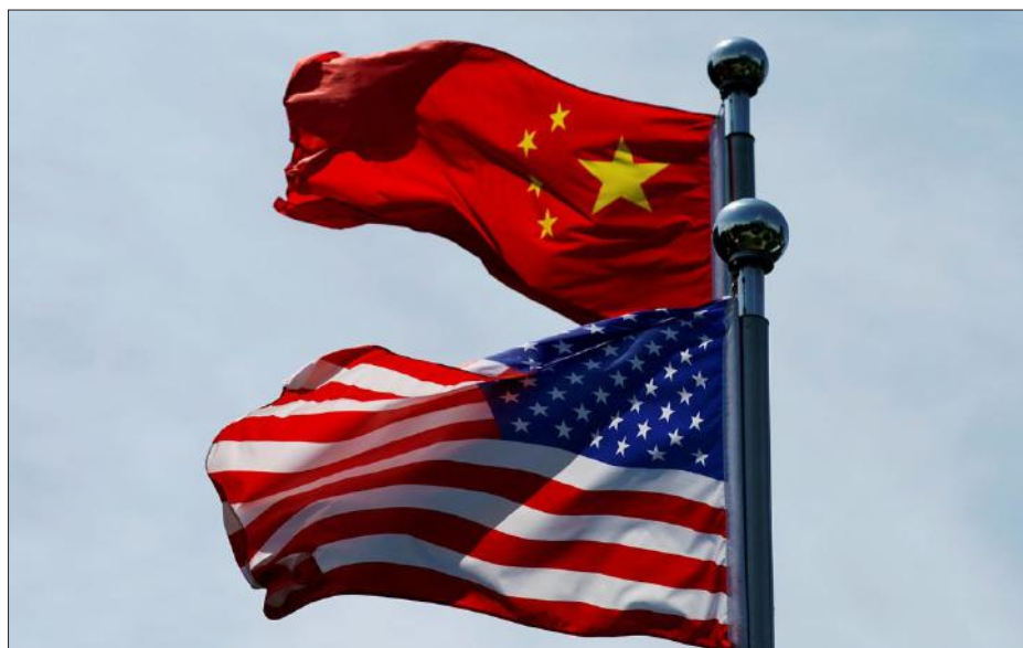
A BABY IS TAKEN AWAY by ambulance after gunmen attacked a maternity hospital, in Kabul, Afghanistan

It rarely confirms details of its operations in Syria, but says Iran's presence in support of President Bashar Assad is a threat to which it will continue to respond.