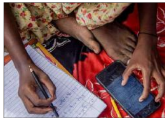
Kumar, a teacher in Dumarthar.

They created blackboards on the walls of students' houses to teach them while maintaining social distancing. "We started with an initiative called 'shiksha aapke dwaar' (education at your doorstep) to provide education to children who did not have access to smartphones and internet. More than 100 blackboards have been created on walls to teach students at their houses," said Tapan