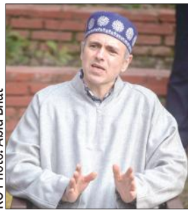
KO Photo: Abid Bhat