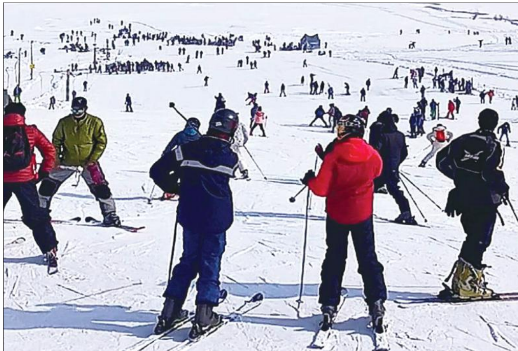
THE TOURISM DEPARTMENT On Friday kick-started the first batch of ski courses in the world famous Gulmarg valley.

Democratic American lawmaker David Trone on Tuesday urged the Indian government to provide safety to the protesting farmers and hailed the recent offers of dialogue and a proposal from India's Supreme Court to set up mediation. —(HT)