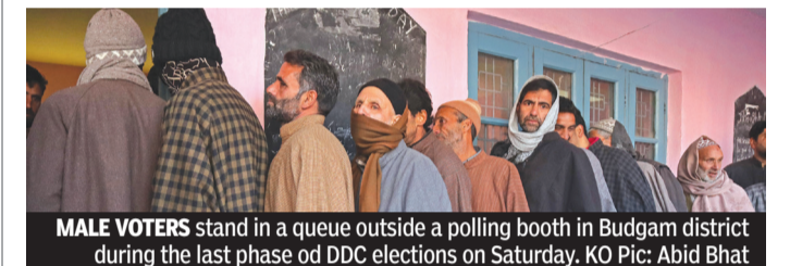
MALE VOTERS stand in a queue outside a polling booth in Budgam district during the last phase of DDC elections on Saturday.

Addressing a press conference here, the SEC said that polling was peaceful in the poll going 28 constituencies of DDC including 13 in Kashmir division and 15 in Jammu division that >> More On P8