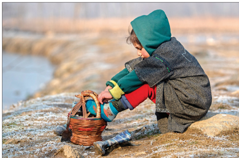
A BOY WARMING his feet using traditional Kashmiri firepot (Kangri) in Srinagar outskirts on Saturday.

SRINAGAR: The second lowest December night temperature in ten years was recorded in Srinagar as the cold wave continued its firm grip across the Valley, the weatherman said on Saturday.