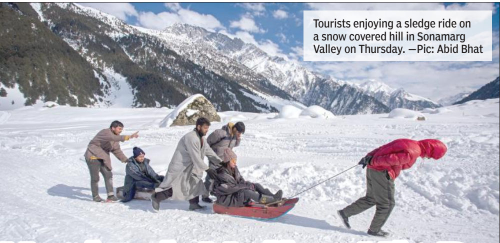
Tourists enjoying a sledge ride on a snow covered hill in Sonamarg Valley on Thursday.

Bear Caught In Kupwara SRINAGAR: The wildlife department officials on Thursday captured a bear, who had strayed into a residential area in Kupwara district of north Kashmir. The bear was on the prowl in the Wasia area for the last few days and had attacked several cattle, news agency GNS reported Thursday. The presence of the beast, the report said, had created panic among the villagers, who informed the authorities. "We received several complaints from locals about the presence of a bear. The wild animal had also attacked cattle," an official of the wildlife department said. "The bear was later trapped in a cage by our officials," he added. This was the sixth such catch in Kupwara district this year.