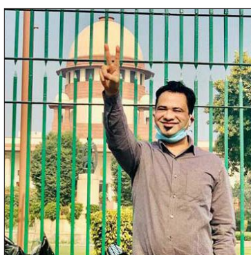
against the backdrop of the protests against the Citizenship Amendment Act.