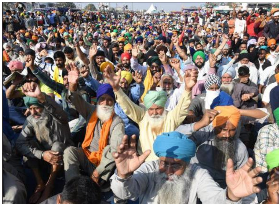
Farmers at the Singhu border.

Authorities said the remaining patients have been discharged and no new cases have been reported since Sunday.