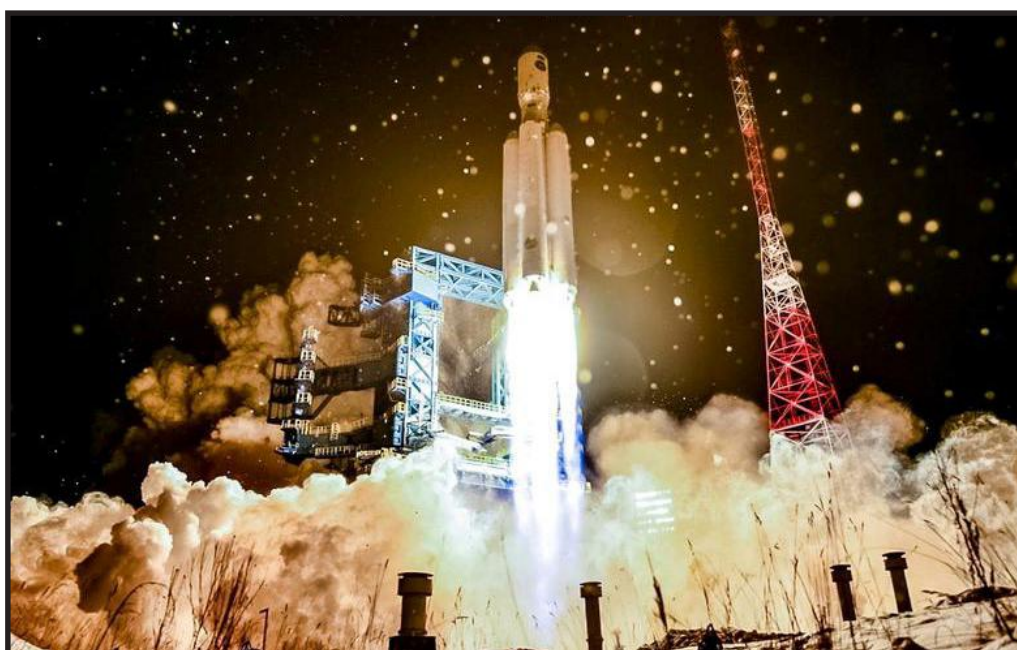
Angara A5 space rocket blasts off at the Plesetsk cosmodrome, Russia