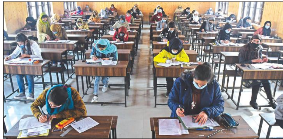
NO PHOTO ABID BHAT

Her remarks came in light of the Supreme Court's observations while hearing the bail plea of Republic TV editor-in-chief Arnab Goswami.