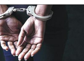
CHENNAI: Three passengers were arrested for carrying 1.84 kg gold valued at 97.82 lakhs at the Chennai International Airport, an official said on Tuesday.

According to Commissioner of Customs, these passengers flew in from Dubai and they were intercepted at the exit on the suspicion of carrying gold. "A total of 1.84 kg gold valued at 97.82 lakhs was recovered and seized under the Customs Act 1962. Three were arrested," said Commissioner of Customs, Chennai International Airport. Further investigation is underway.