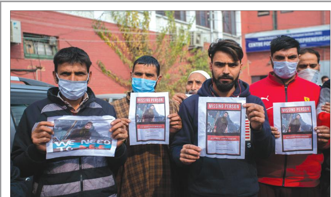
Holding posters in their hands, family members of a missing army man staged peaceful protest in Srinagar's press enclave on Wednesday.