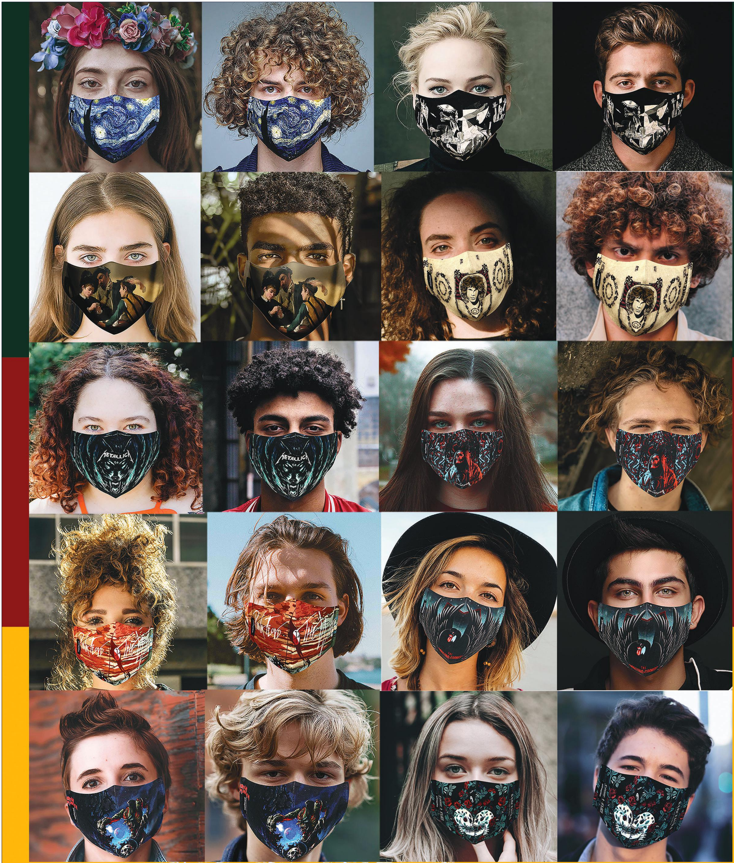
..... DESIGNED & CONCEPTUALISED IN NEW YORK .....