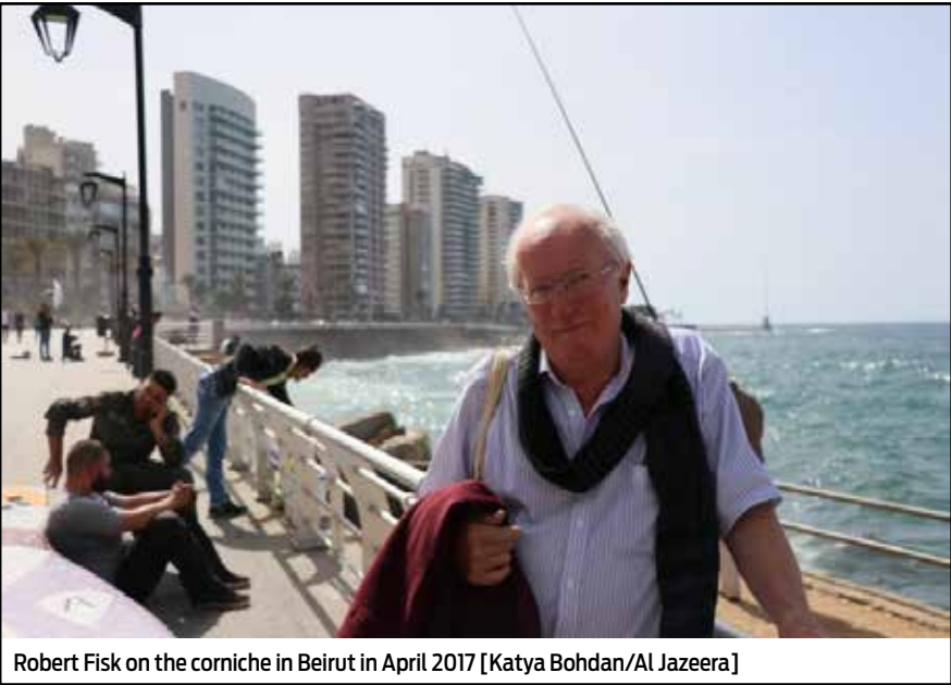
Robert Fisk on the corniche in Beirut in April 2017

Back in 2017, when I had interviewed him for the Belgian news outlet, in an