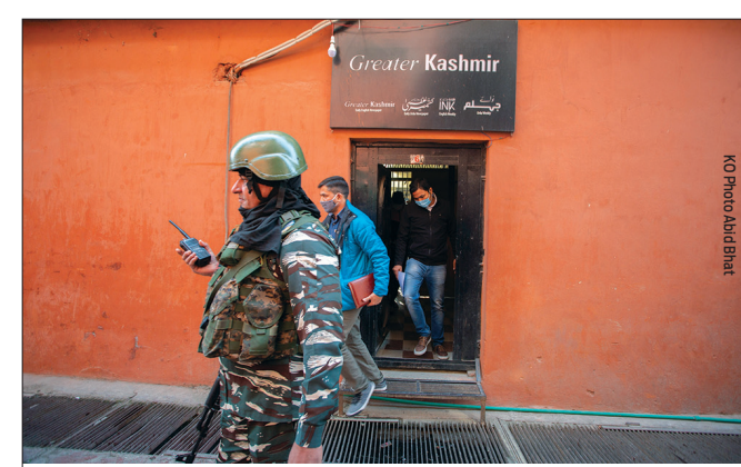
NIA team leaving GK office after carrying out searches on Wednesday.

The Probe Agency Conducts Searches At 10 Places, Including Offices Of NGOs And A Newspaper As Well As Homes Of Activists And Journalists.