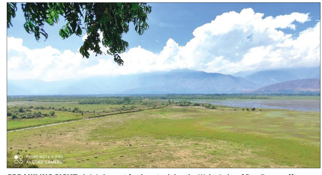
SPRAWLING SIGHT: Asia's largest fresh water lake, the Wular Lake of Bandipora, offers a spectacular view on Saturday.

claimed in the video. Later on Friday, Mr Bhatt released a statement through his lawyer which was posted on the official Twitter handle of his banner Vishesh Films.