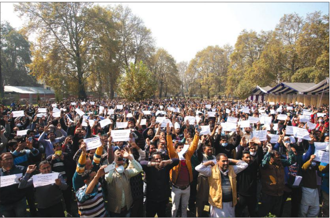
UP IN ARMS: In order to press for their pending employment demands, dailywagers staged a massive protest rally in Srinagar on Wednesday.

He is gearing up for the shooting of his next, "KGF: Chapter 2", in November. The period action film, starring Yash, marks Sanjay Dutt's Kannada debut. PTI