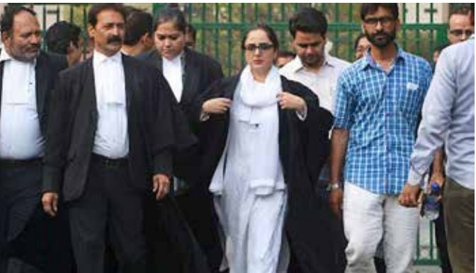
The lawyer had earlier faced immense hate for representing the 8-year-old victim from the Bakarwal nomad community in Jammu.

"Alert: Several right-wing organisations have been staging angry protests outside my residence. Law enforcement agencies must intervene immediately to