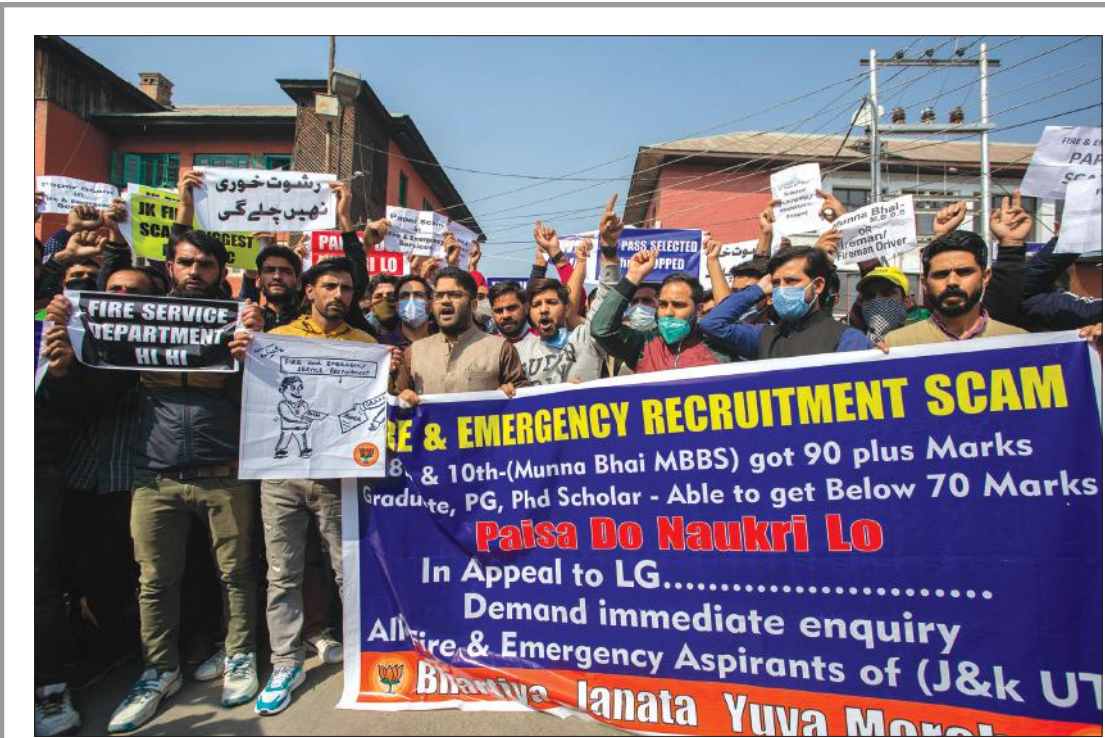
PROTEST PITCH: BJP Yuva Morcha and Fire services aspirants lodged a strong protest on Saturday in Srinagar's Press Colony against the "Recruitment Scam".