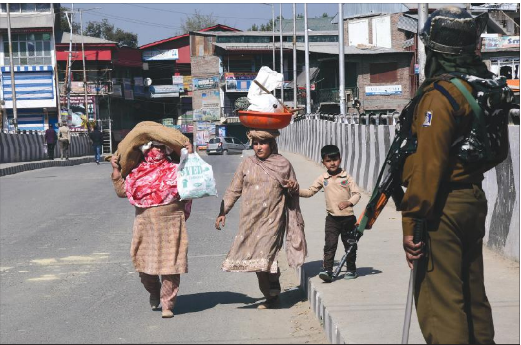
FRETFUL WALK: Paramilitary trooper looks on as women along a kid walk near an encounter site at Chadoora, Budgam on Friday.