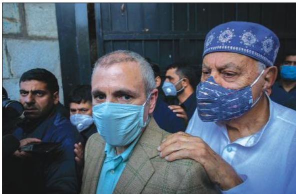
Omar Abdullah with father Dr Farooq seen here outside the residence of Mehbooba Mufti

When asked if the alliance was opportunist or political, Omar said it was a continuation of what started on August 4, 2019 when most parties ● PAGE 02