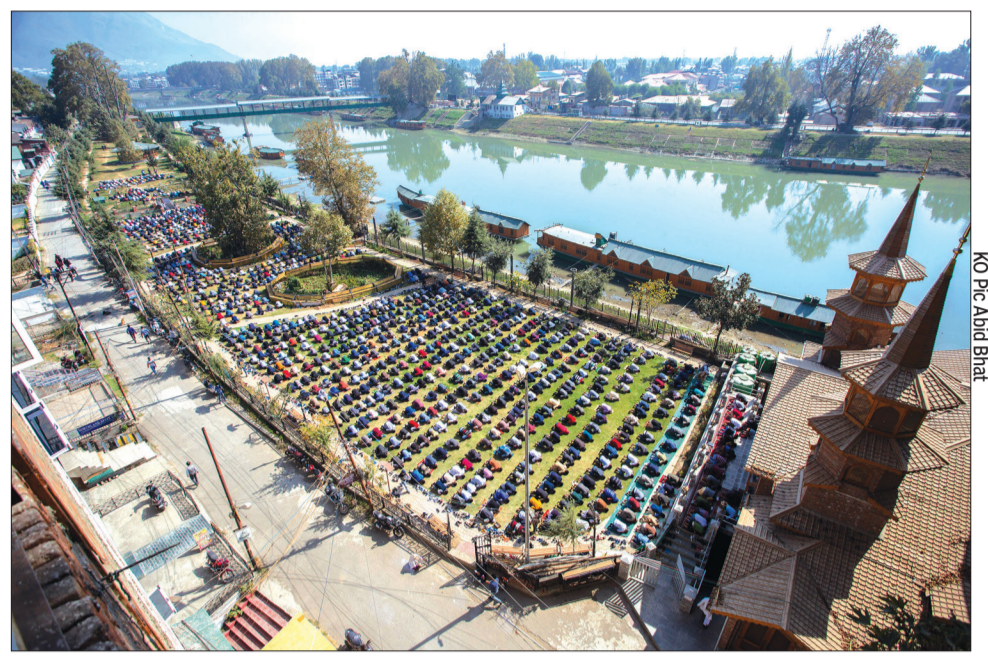
Devotees offering congregational Friday prayers at an open space near river Jhelum in Srinagar.

The BJP in Jammu and Kashmir on Friday alleged that the "Gupkar alliance" has been formed on directions of Pakistan and China and guided by "anti-India" forces, and warned that the alliance partners will ● P-02