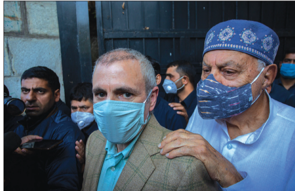
Omar Abdullah with father Dr Farooq seen here outside the residence of Mehbooba Mufti

When asked if the alliance was opportunist or political, Omar said it was a continuation of what started on August 4, 2019 when most parties ● PAGE 02