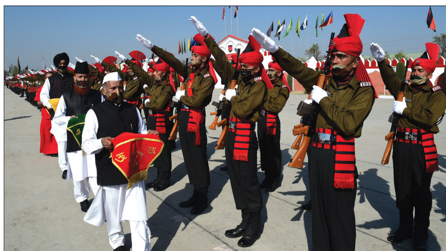
NEW RECRUITS of the J&K Light Infantry take oath at the end of a passing out parade at an army base on the outskirts of Srinagar.

of the despotic and anarchic rule the people of this land have witnessed for hundreds of years when we were crushed under the heavy burden of taxation. It is nothing but the revival of that dark, dreadful and disastrous era