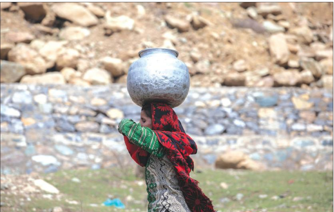
DAILY SLOG: A Kashmir woman carrying an aluminium water tumbler on her head in a countryside area on Saturday.