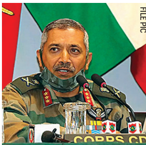
18 in which the Army claimed that three militants were killed. "We have already shared the basic information