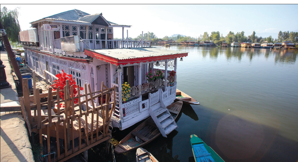
LAST FLOATING POST OFFICE! World Post Offices Day was observed on Friday. Picture shows remnants of floating post office at Dal Lake.

half of the petitioner on 19th of August, 2020 when noticing the above fact the matter was adjourned for today in the interest of justice," the court said, adding, "The Government of India has therefore issued the legislation prohibiting use, sale and manufacture of electronic nicotine delivery system. Clearly, the petitioner has lost interest in ▶PAGE 02