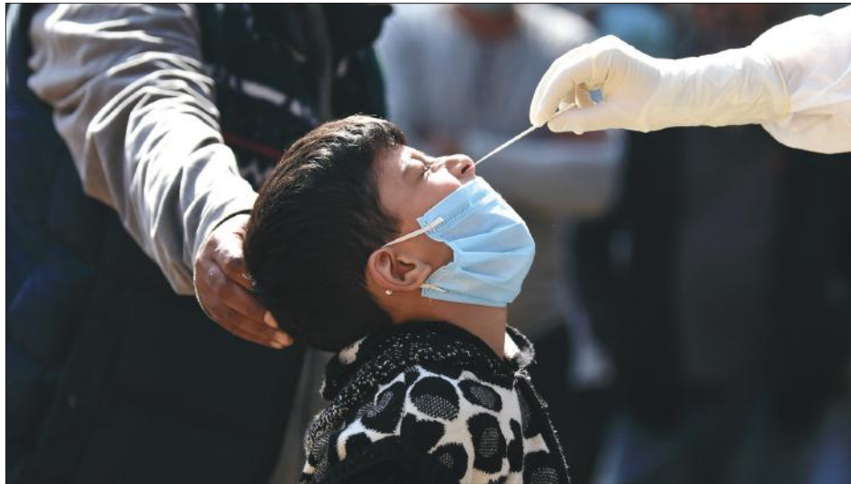
A HEALTH WORKER taking nasal swab of a boy for Coronavirus test in Srinagar on Tuesday.

WITH IMMEDIATE EFFECT, THE ACTS MENTIONED IN the schedule to this order shall, until repealed or amended by a competent legislature or other competent authority, have effect, subject to the adaptations and modifications directed by the said schedule, or if it is so directed, shall stand repealed.