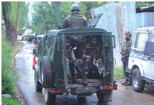
No File Pic Andh Bhat

He said that the search operation turned into an encounter after the militants opened fire upon the joint team of state forces. The search team, he said retaliated the fire triggering an encounter in which two