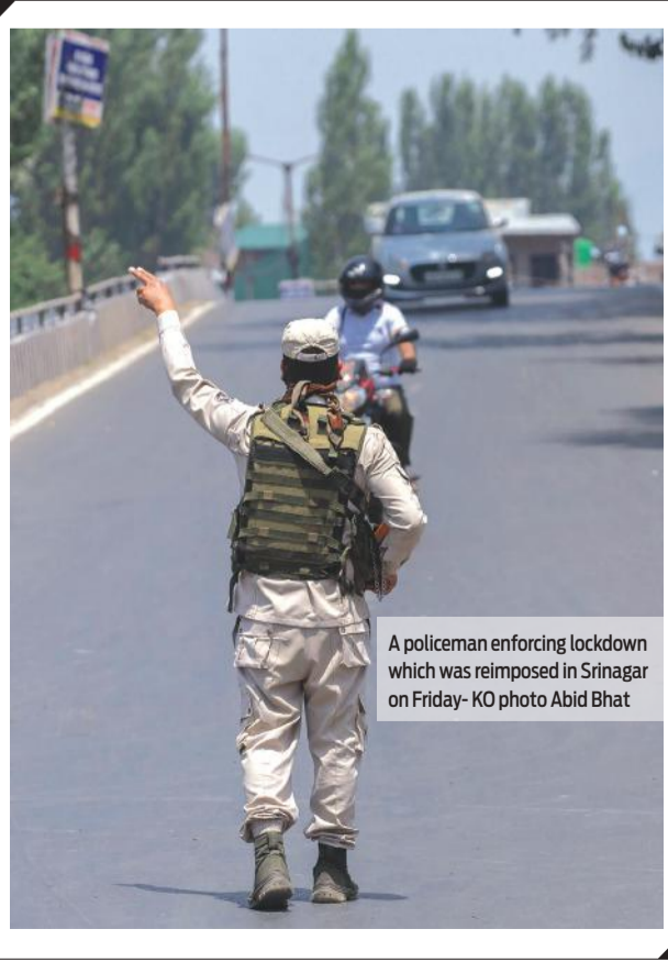
A policeman enforcing lockdown which was reimposed in Srinagar on Friday