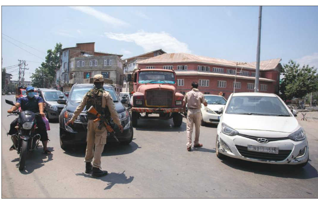
LOCKDOWN WAS STRICTLY ENFORCED in various areas of downtown Srinagar on Friday