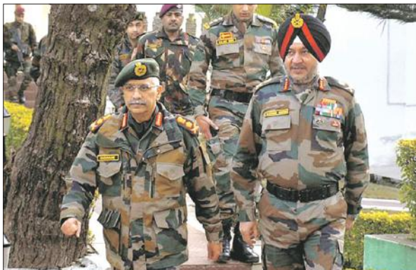
Army Chief Naravane (left) in a file picture

Amidst carrying out combat air patrols over Ladakh and maintaining operational readiness platforms at various airbases to scramble fighters, the IAF is using its American C-17s and Russian IL-76s freighters for carrying out multiple sorties out of Chandigarh and other places ● PAGE 02