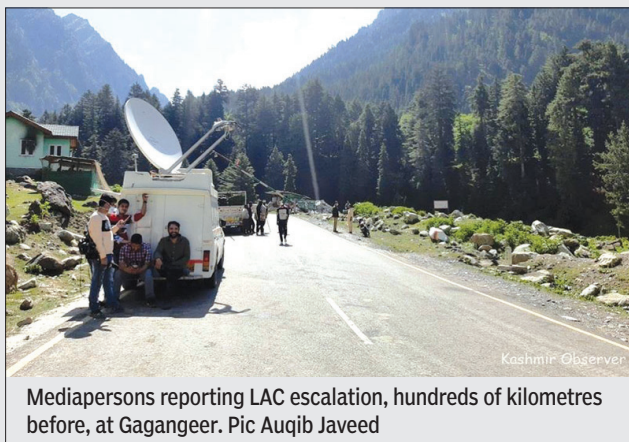
Mediapersons reporting LAC escalation, hundreds of kilometres before, at Gagangeer.