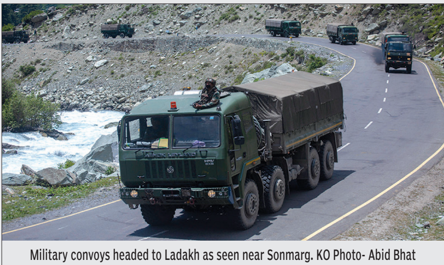
Military convoys headed to Ladakh as seen near Sonmarg.